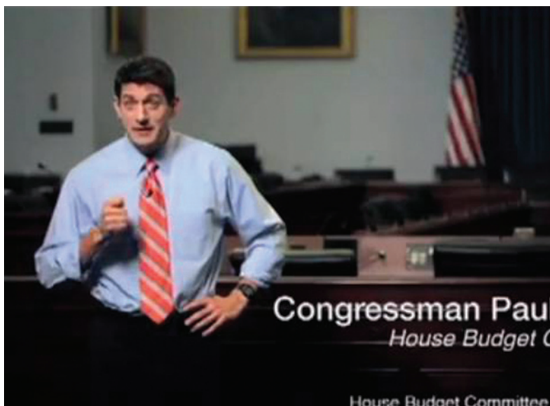
60 Plus Commercial, "Guaranteed"

If you have been watching the news and keeping current with the 60 Plus Association's web site and email alerts, you see very clearly that the major political battle of our day is being fought right now in Washington. This contest will affect millions of seniors today and every other American for decades to come. Many believe that the very survival of our nation as we know it hangs in the balance.