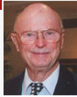
REP. ROGER ZION (R-IN. 1967-75) Honorary Chairman