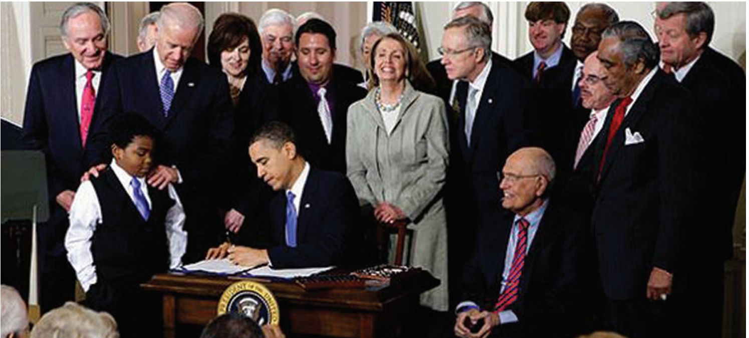
President Obama signs the healthcare reform bill into law.